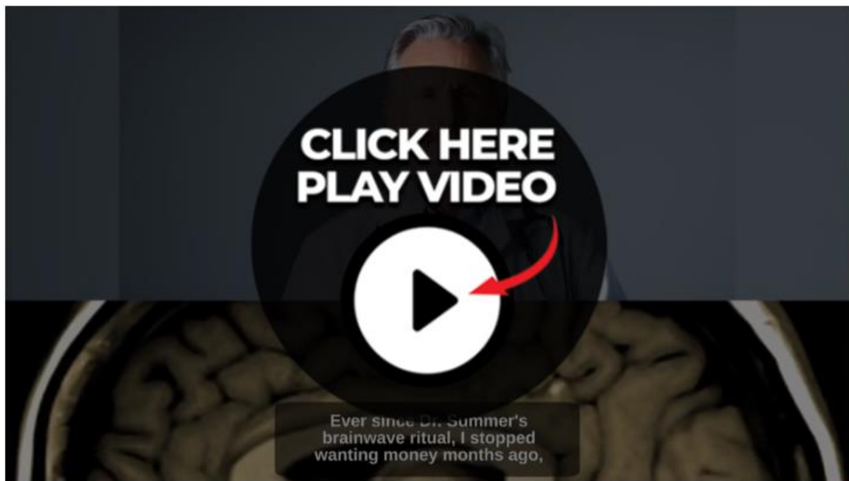
Billionaire Brain Wave Review Video

Ans:- You can enhance your life by experiencing many benefits like more money, better relationships, and reduced stress. It can also boost motivation, and creativity, and help you reach your full potential.