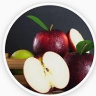
Boron Citrate Complex