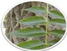
Amur Cork Bark