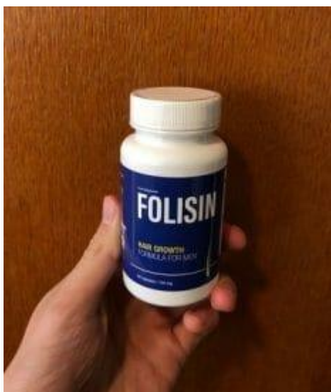
Folisin hair loss capsules

There are many causes of hair loss, but each of them must be treated with the same seriousness, because ignored may lead to irreversible consequences. Therefore, when we notice the first signs that something is wrong with our hair, there are such ailments as thinning of the hair on top of the head or enlarged cornrows, it is time to take action.