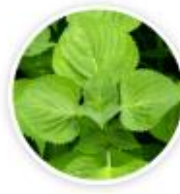
Perilla Leaf Extract

FlowForce Max is designed to support prostate health and improve overall vitality through a carefully curated blend of natural ingredients. Each component plays a vital role in promoting urinary function, reducing inflammation, and enhancing physical performance. In this section, we'll take a closer look at each ingredient in FlowForce Max and explore its benefits and contributions to the supplement's efficacy.