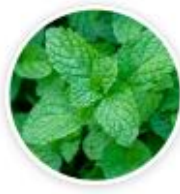
Peppermint Leaf Extract Powder