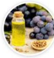
Grape Seed Extract