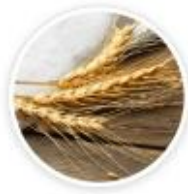
Graminex Flower Pollen Extract