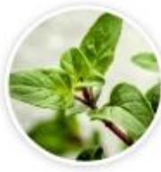
Oregano Leaf Extract