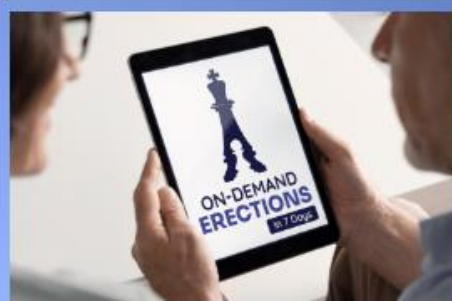
BONUS #2 - On-Demand Erections in 7 Days

This is a simple, step-by-step guide for cleansing your kidneys from the comfort of your own home.