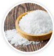
Magnesium Stearate Powder