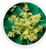
Muira Puama Extract