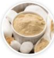
Silk Protein Powder