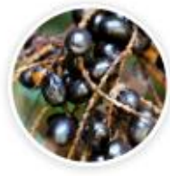
Saw Palmetto Fruit Extract Powder