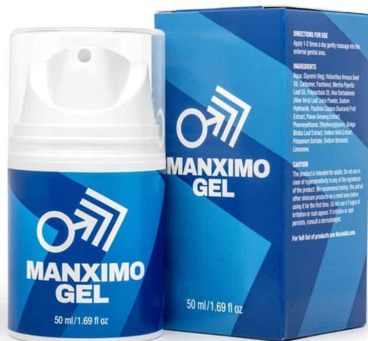
Manximo Gel PRO6

Potency problems spend the sleep of many men, no longer affecting only those in middle or old age. Younger and younger men are beginning to complain, with erectile dysfunction being one of the most commonly diagnosed ailments. They can almost completely disrupt or even prevent a normal sex life. That's why it's worth using an effective remedy—erectile dysfunction support gel – as soon as you notice the first disturbing symptoms. Manximo Gel . Its composition is composed of natural, plant-based active substances, so it is also safe and does not cause any side effects.