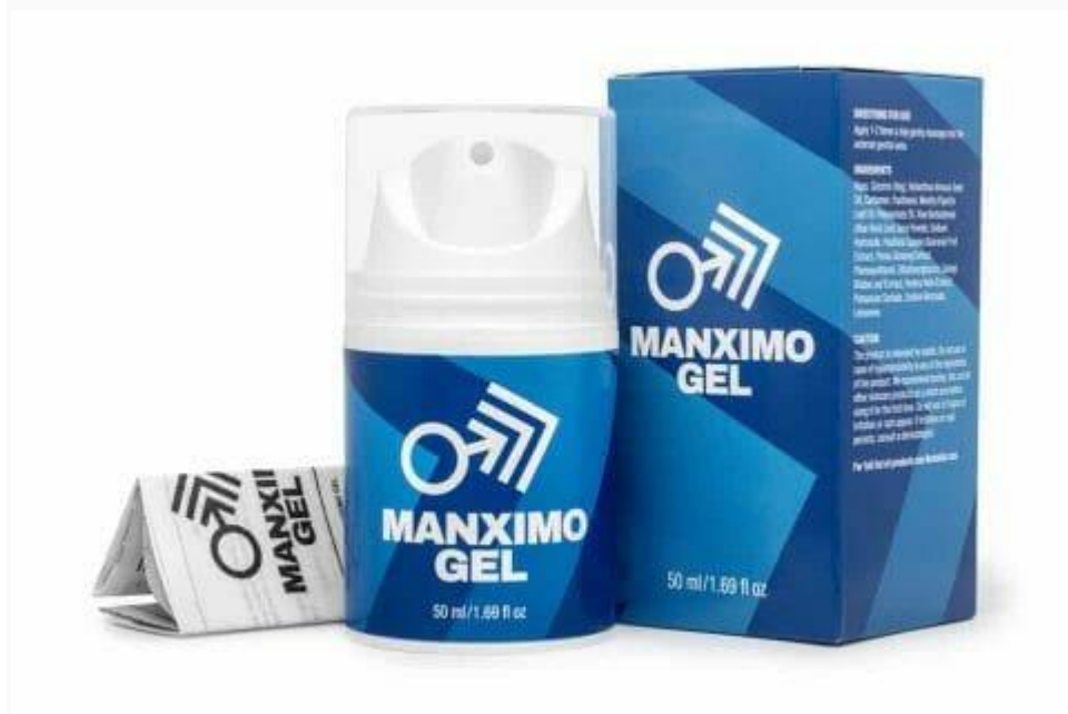
manximo gel for erection

Another cause of erectile difficulties are a number of diseases, one of the symptoms of which is decreased libido. These involve, among other things, hormonal management, a decline in the level of the most important male hormone, testosterone . Similar effects can be caused by thyroid diseases and the effects of mechanical damage to the genitals, trauma, injury and even complications from surgery.