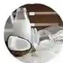
Coconut Juice Powder