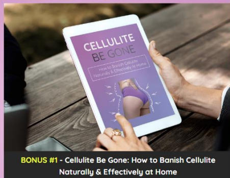
BONUS #1 - Cellulite Be Gone: How to Banish Cellulite Naturally & Effectively at Home

Order 6 Bottles or 3 Bottles and Get 2 FREE Bonuses!