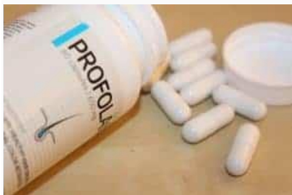
Profolan tablets scattered on the table

Since its appearance on the market, Profolan has gained the position of the most effective, even revolutionary supplement not only preventing premature balding, but also supporting the growth of new, healthy hair.