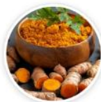
Turmeric Root Extract