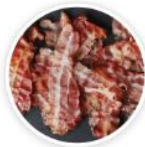
Bacon Type Flavor Natural