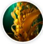
Organic Kelp Powder

can also improve the quality of your dog's breath, making it a great choice for dental health. It has antioxidant properties that can combat free radicals, contributing to your pet's overall health and well-being. Including this ingredient in Pawbiotix reinforces the formula's commitment to supporting gut health and overall vitality.