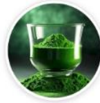
Sodium Copper Chlorophyllin