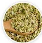
Fennel Seed Powder