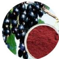
Black Currant Extract