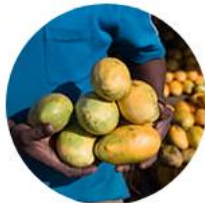
African Mango Extract