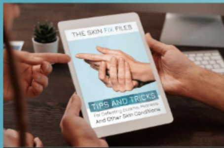
Bonus #1 - BONUS #1 - The Skin Fix Files: Tips and Tricks for Defeating Eczema, Psoriasis, And Other Skin Conditions

Order 6 Bottles or 3 Bottles and Get 2 FREE Bonuses!