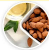
Sweet Almond Oil