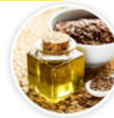
Organic Flaxseed Oil