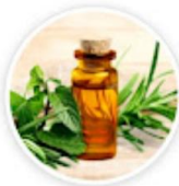
Tea Tree Oil