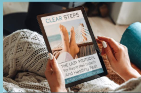
Bonus #2 - Clear Steps: The Lazy Protocol For Rapid Nail Growth And Healthy Feet After Fungus Recovery

Inside you'll discover how you can address common skin conditions like psoriasis or eczema, faster and easier than you ever thought possible.